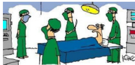
"Nurse, get on the internet, go to SURGERY.COM, scroll down and click on the 'Are you totally lost?' icon."